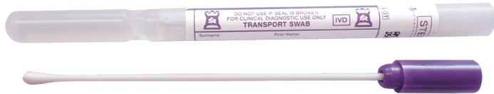
1 Amies swab for bacterial culture