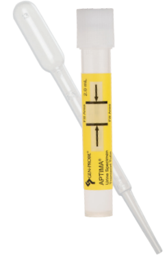
5 Aptima Urine Collection Kit