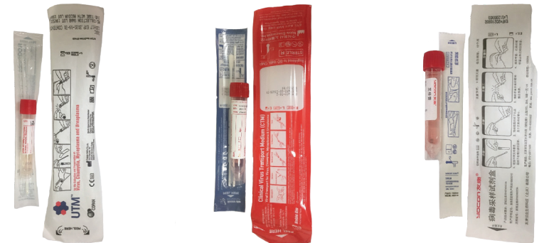
6 Multiple Brands with Universal Transport Media (UTM) and/or Viral Transport Media (VTM)

(Including Herpes, Varicella, Measles and SARS-CoV-2)