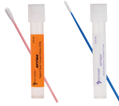
4 Aptima Multi-Test and Unisex Swab

(Chlamydia, Gonorrhoea, Trichomonas and M. Genitalium ONLY)