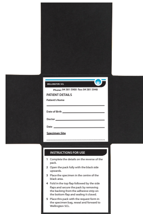
2 Mycology pack (for example nail clippings, skin scrapings, hair etc)